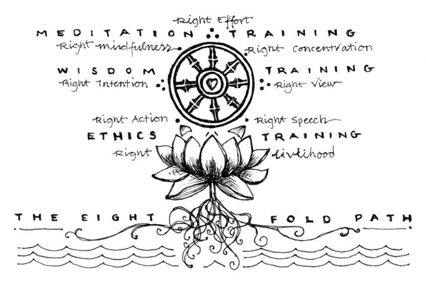
Magnus Buddha; maior autem Veritas